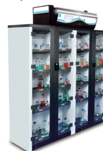
With spill-proof shelves