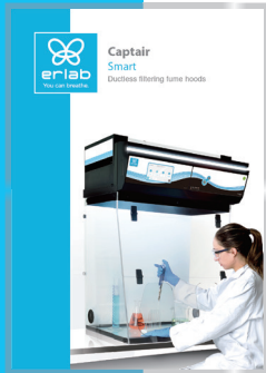
Smart Fume Hoods for your routine handlings