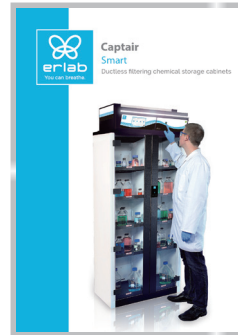
Captair Smart Storage cabinets