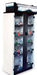
With spill-proof shelves