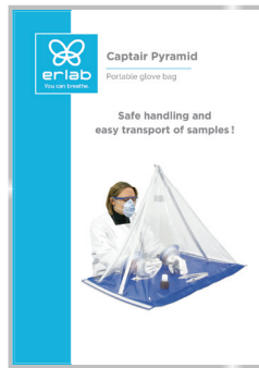
Captair Pyramid Portable Glovebox