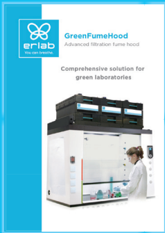
GreenFumehoods an alternative to ducted fume hoods