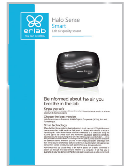
Halo Sense Lab Air Quality Sensor