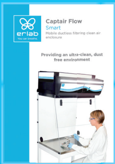
Captair Flow Clean Air Enclosures