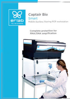
Captair Bio PCR Workstations