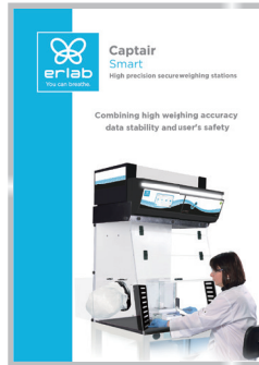
Captair Smart Weighing Stations