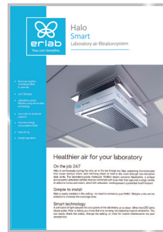
Halo Laboratory Air Filtration system