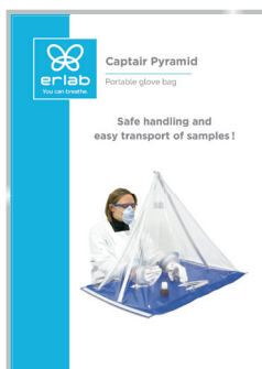
Captair Pyramid Portable Glovebox