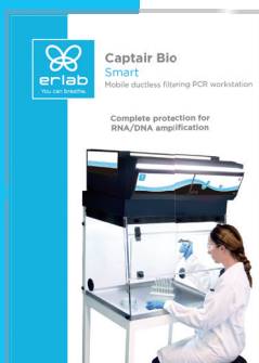
Captair Bio PCR Workstations