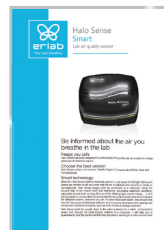
Halo Sense Lab Air Quality Sensor