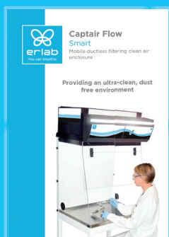
Captair Flow Clean Air Enclosures