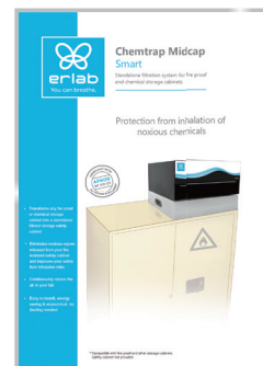
Chemtrap Midcap Filtration System