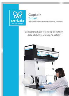
Captair Smart Weighing Stations