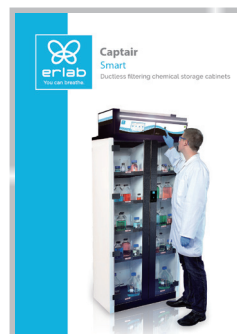
Captair Smart Storage cabinets