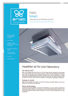
Halo Laboratory Air Filtration system