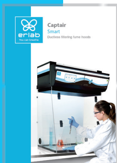
Smart Fume Hoods for your routine handlings