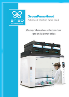
GreenFumeHoods an alternative to ducted fume hoods