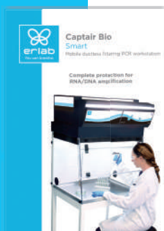
Captair Bio PCR Workstations