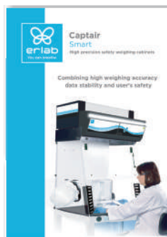
Captair Smart Weighing Stations