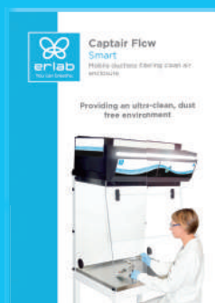
Captair Flow Clean Air Enclosures