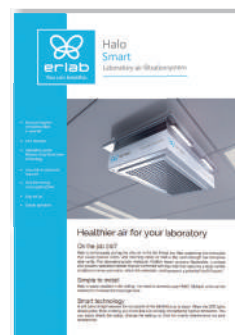
Halo Laboratory Air Filtration system