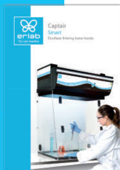
Smart Fume Hoods for your routine handlings