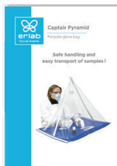
Captair Pyramid Portable Glovebox