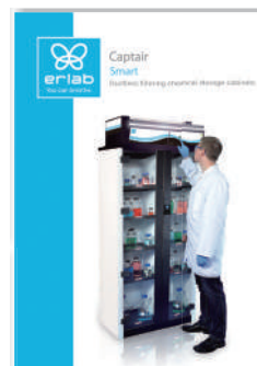
Captair Smart Storage cabinets