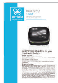
Halo Sense Lab Air Quality Sensor