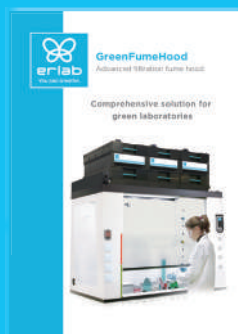
GreenFumeHoods an alternative to ducted fume hoods