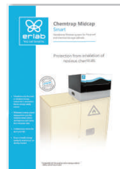
Chemtrap Midcap Filtration System