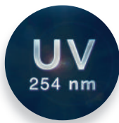
UV-C Germicidal lamp